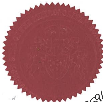
Council Solicitor and Secretary